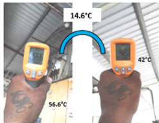
Ceiling Temp Diff: Uncoated and Coated Roof: 11.4°C