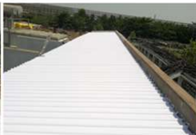
Completed Two Coats of Thermacool 0.3M