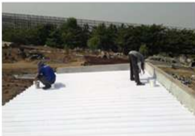
Appln Second Coat of Thermacool 0.3M