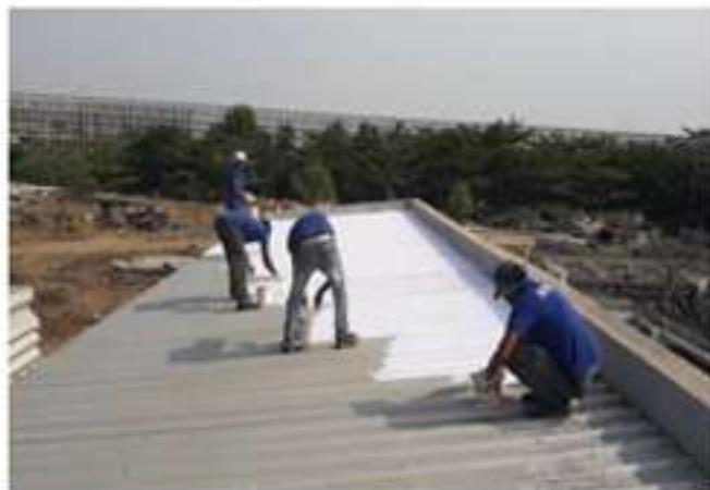
Appln of First Coat of Thermacool 0.3M