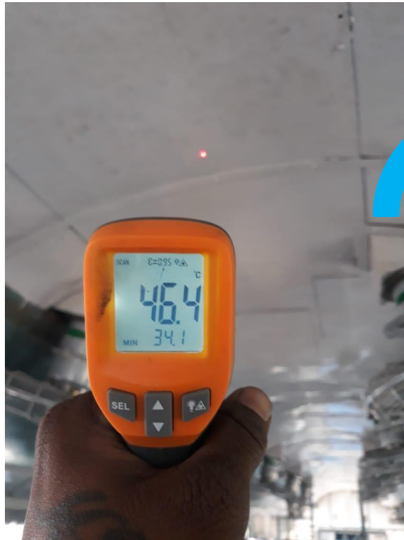
Uncoated Coach 016142 Ceiling Temp