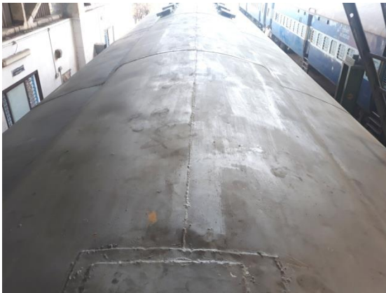
SURFACE PREPARED ROOF OF FLYING RANEE COACH