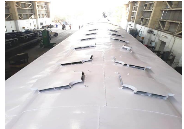
2 COAT APPLICATION COMPLETED OF THERMACOOL 0.3M FR