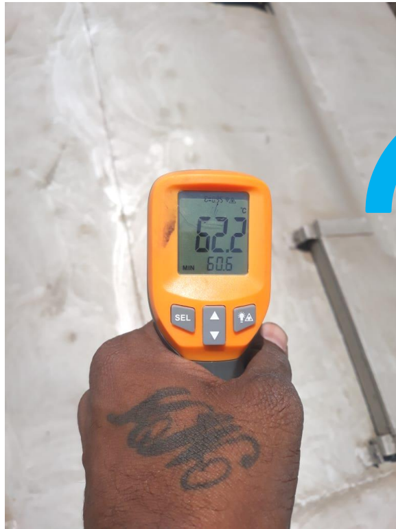
Uncoated Coach 016142 Roof Temp