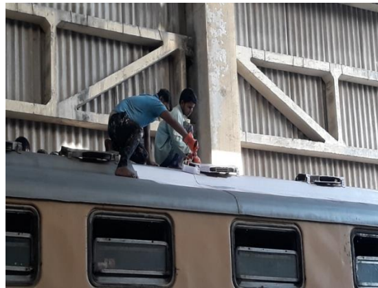
FIRST COAT APPLICATION OF THERMACOOL 0.3M FR