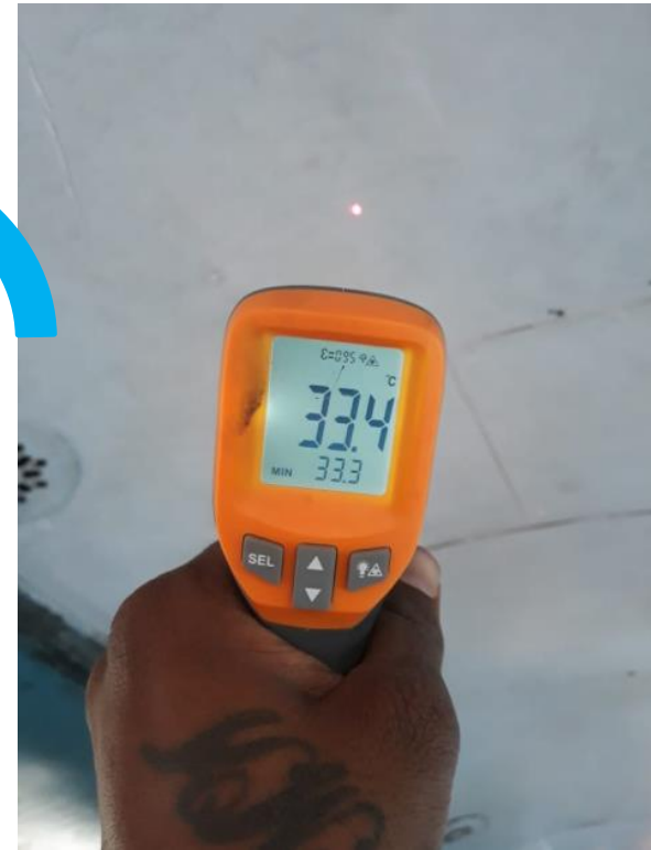
Coated Coach 016092 Ceiling Temp