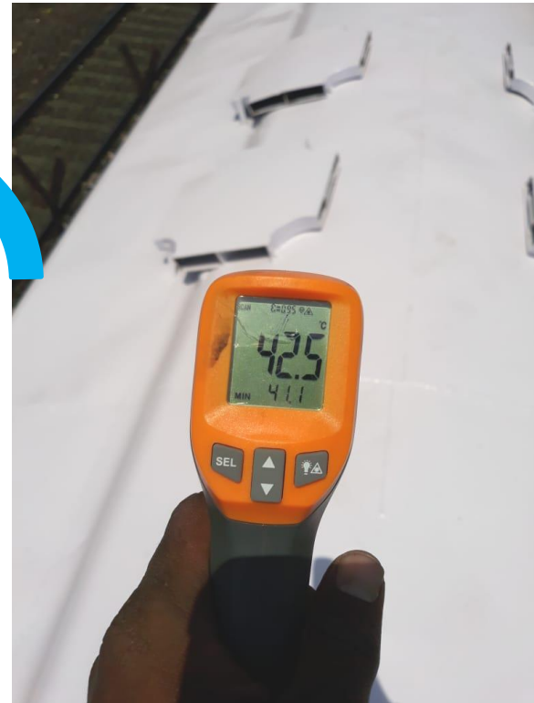
Coated Coach 016092 Roof Temp